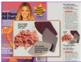
Cosmopolitan January 2009

Jane Iredale Mineral Makeup- Proud participants of Campaign for Safe Cosmetics Recent awards and mentions: Beauty Launchpad December 2008 Exciting news! jane iredale was the winner of nine Readers Choice Awards jane iredale completely swept the makeup category, winning in all sub-categories jane iredale was also a winner in the Skincare category for Sugar&Butter .