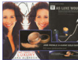
The Chicago Woman November 2008