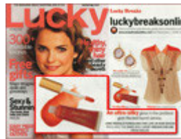
Lucky December 2008